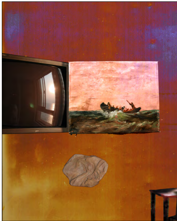
The Contemplation of Nature 2/50, archival computer print, 32 x 24 in.