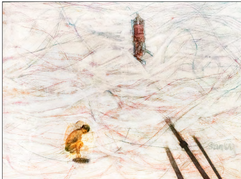
Inquiry, acrylic and watercolor on canvas, 36 x 48 in., 2018